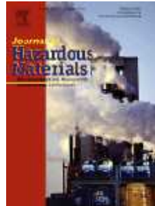
Journal of Hazardous Materials Publisher: Elsevier