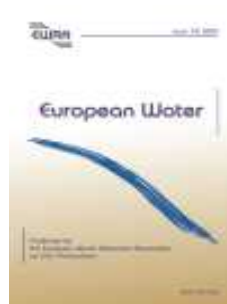
European Water Publisher: E.W. Publications