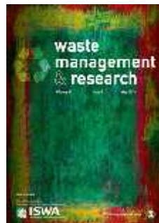
Waste Management & Research Publisher: SAGE Journals