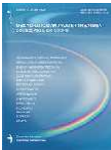
Desalination and Water Treatment Science and Engineering Publisher: Desalination Publications