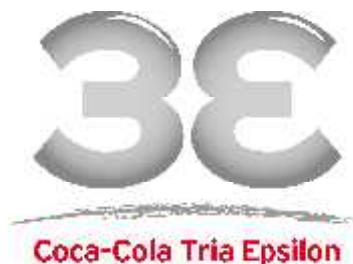
Coca-Cola Tria Epsilon