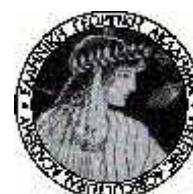
Hellenic Agricultural Academy