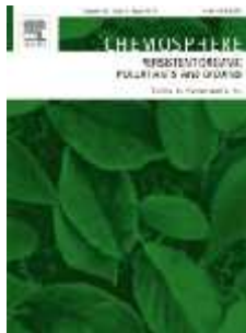
Chemosphere Publisher: Elsevier