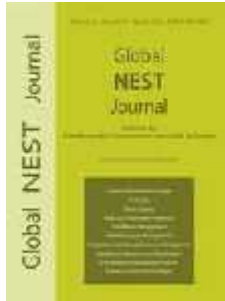
Global NEST Journal Publisher: Global NEST

A number of presented papers will be considered for inclusion in special issues of the following journals after the peer review process: